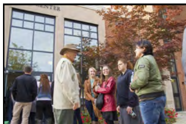
“President Teddy Roosevelt” greets guests at the Symposium