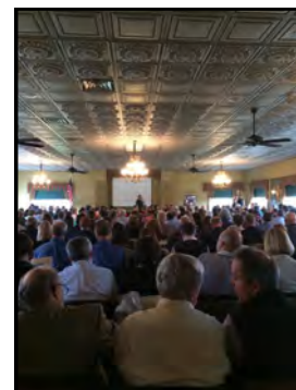
PA Oil & Gas Hub event at Cross Creek