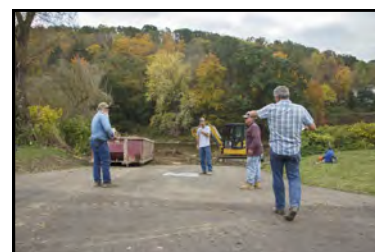
BKI employees working at Oil Creek Memorial Landing