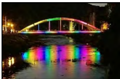
Center Street Bridge in Oil City