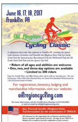
Poster for the Oil Region Cycling Classic